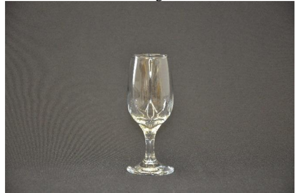
RG39 6.5oz Tapered Wine 0.38 ea