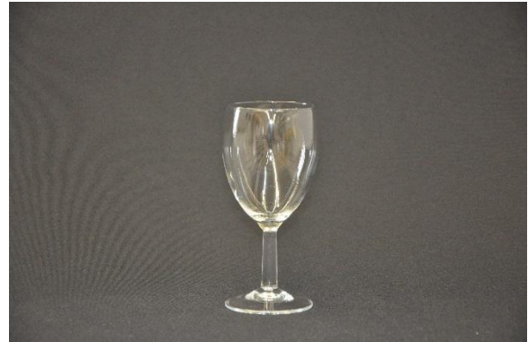
RG10 Tasting 8oz (SS) 0.38 ea