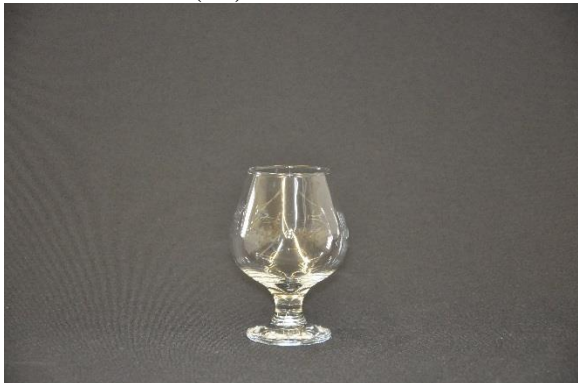
RG4 Brandy 9oz (SS) 0.40 ea