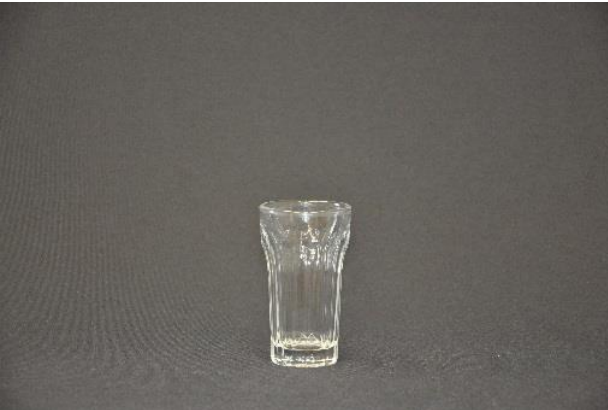
GL3 Juice 4.5oz 0.30 ea