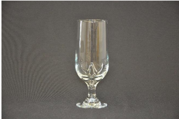
GL1 12oz Beer Glass OR 14oz Beer Glass 0.40 ea