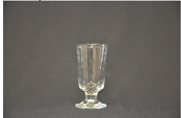
RG8 Footed Highball 8oz (SS) 0.38 ea