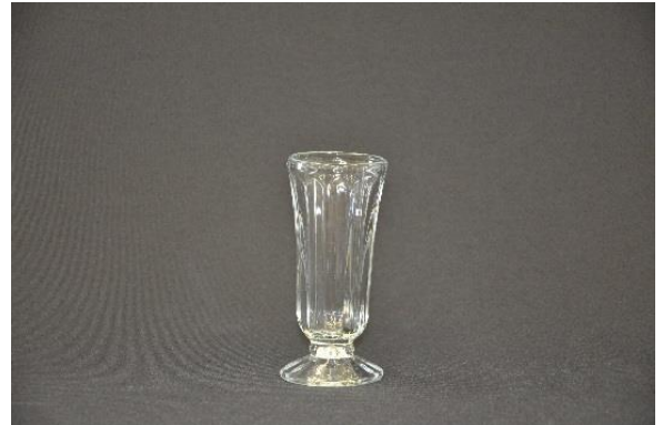
GL7 Sorbet 0.30 ea