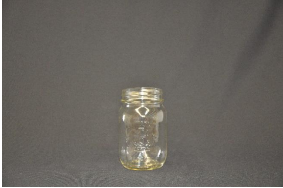
RG33 Mason Jar 0.50 ea