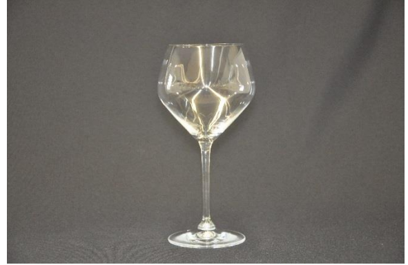
RG31 24oz Ridell Tasting 1.00ea