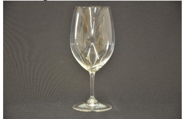
RG21 Water 8oz 0.38 ea