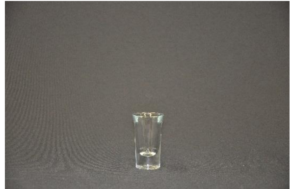
GL6 Shooter 0.30 ea