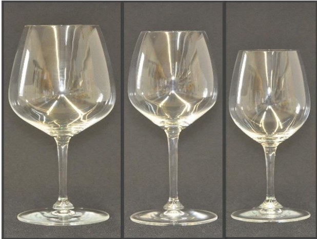
RG24 Ridell Wine 14oz, 16oz, or 26oz 1.00 ea RG26 Diana Wine 6oz OR 8oz 0.60 ea