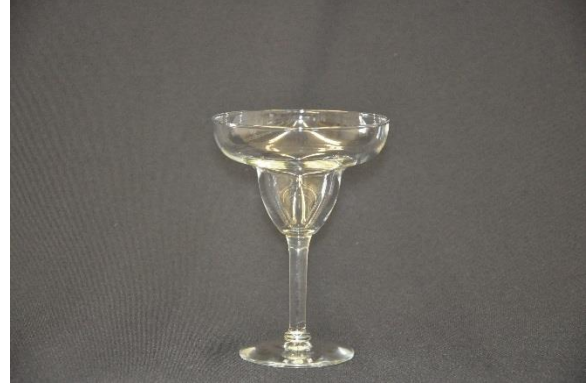
RG20 Margarita 9oz 0.65 ea