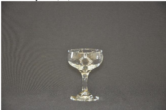
RG5 Champagne Saucer 4.75oz (SS) 0.38 ea