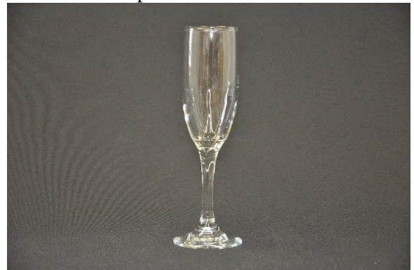
RG38 Crystal Champagne 6oz 0.40 ea