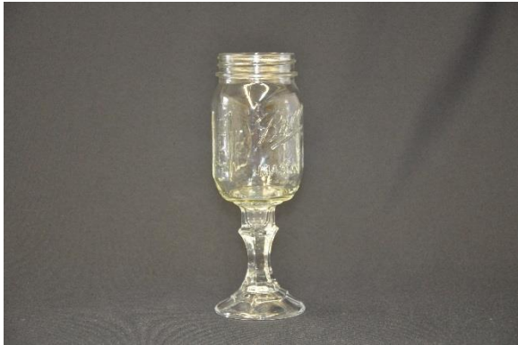
RG34 Mason Jar on Stem 1.50 ea