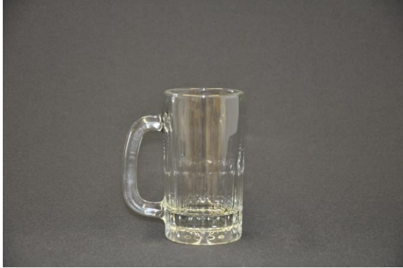
RG1 Beer Mug 12oz 0.40 ea