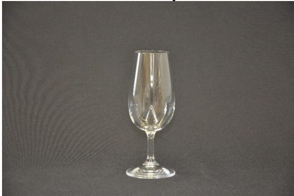
RG12 Inaho 7.5oz (SS) 0.38 ea