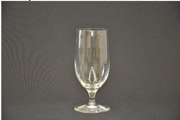
RG16 Crystal Water OR Beer 0.40 ea