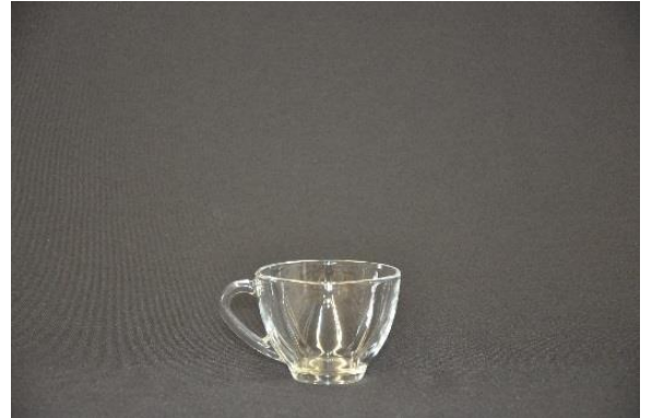
GL5 Punch Glass 8oz 0.30 ea