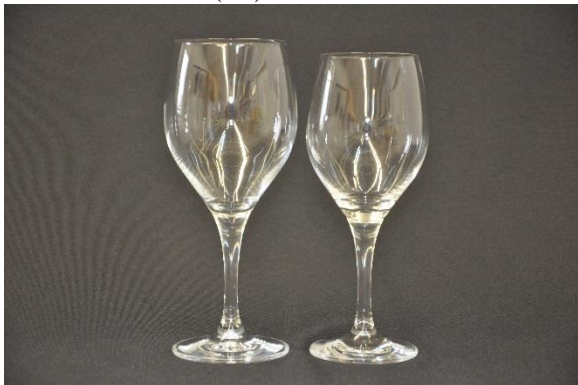
RG14 Crystal Wine 11oz (LS) RG15 (14oz) 0.40 ea