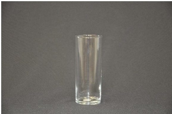
RG36 Mojito 0.38 ea