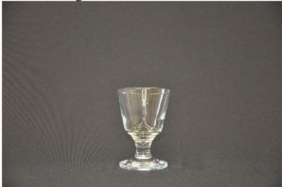
RG3 Rock 5.5oz (SS) 0.38 ea