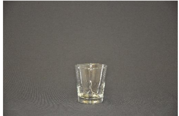
GL4 Old Fashion 7.75oz 0.30 ea