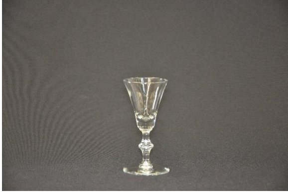
RG11 Porto 3 oz RG19 Sherry 2oz 0.35 ea