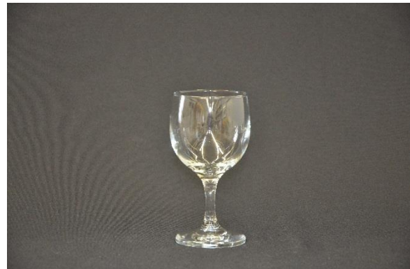
RG22 Wine 6.5 oz RG23 Wine 8.5 oz 0.38 ea