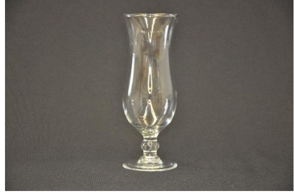
RG7 Daiquiri 15oz 0.40 ea